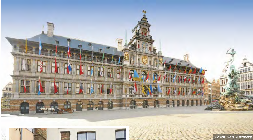
Town Hall, Antwerp