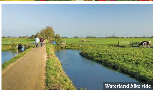
Waterland bike ride