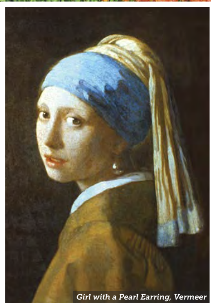
Girl with a Pearl Earring, Vermeer