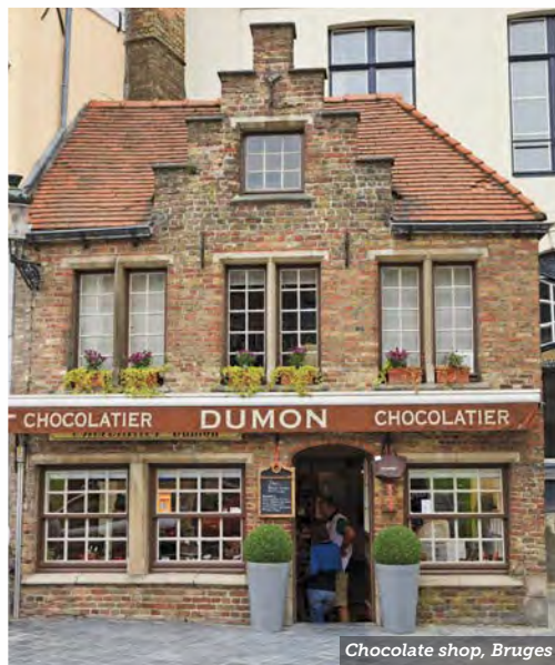
Chocolate shop, Bruges

Enrichment: The Dutch Masters. Learn how these Golden Age artists painted their realistic portraits, landscapes and still lifes.