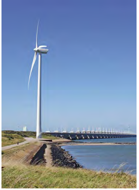
Right: Delta Works, Neeltje Jans