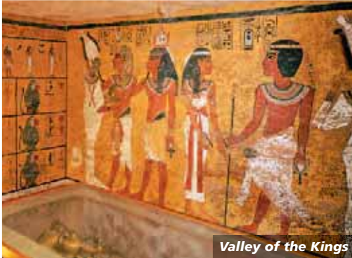
Valley of the Kings