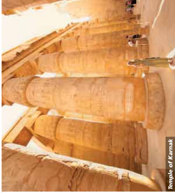
Temple of Karnak