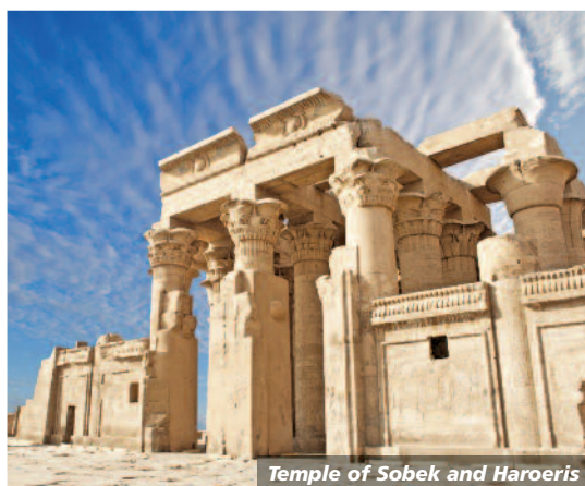
Temple of Sobek and Haroeris

After lunch on the ship, sail through Esna Lock, then enjoy free time onboard.