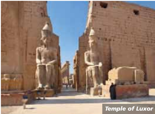
Temple of Luxor