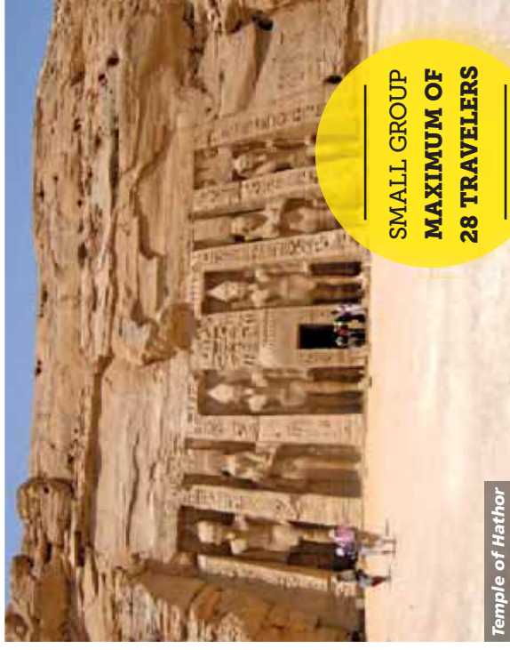
Temple of Hathor