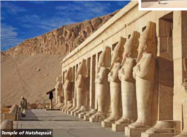
Temple of Hatshepsut